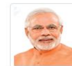
Shri Narendra Modi Hon'ble Prime Minister

Hon'ble Prime Minister has announced that on the occasion of Ambedkar Jayanti, a "Gram Swaraj Abhiyan" could be organised starting from 14 th April to 05 th May, 2018. The campaign, undertaken under the name of "Sabka Sath, Sabka Gaon, Sabka Vikas", is to promote social harmony, spread awareness about pro-poor initiatives of government, reach out to poor households to enroll them as also to obtain their feedback on various welfare programmes. As a special endeavour during the Gram Swaraj Abhiyan, saturation of eligible households/persons would be made under seven flagship pro-poor programmes in 21,058* identified villages, namely, Pradhan Mantri Ujjwala Yojana, Saubhagya, Ujala scheme, Pradhan Mantri Jan Dhan Yojana, Pradhan Mantri Jeevan Jyoti Bima Yojana, Pradhan Mantri Suraksha Bima Yojana and Mission Indradhanush.